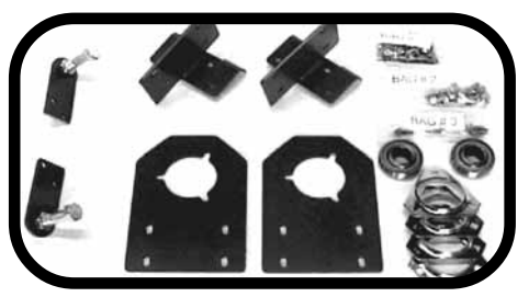
Includes drivelines (shown at right)