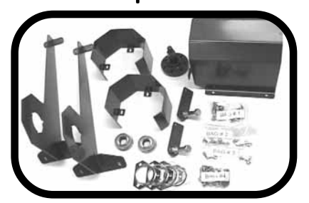
Includes drivelines (shown below)

Flex/Rigid Platform Conversion Kit Components