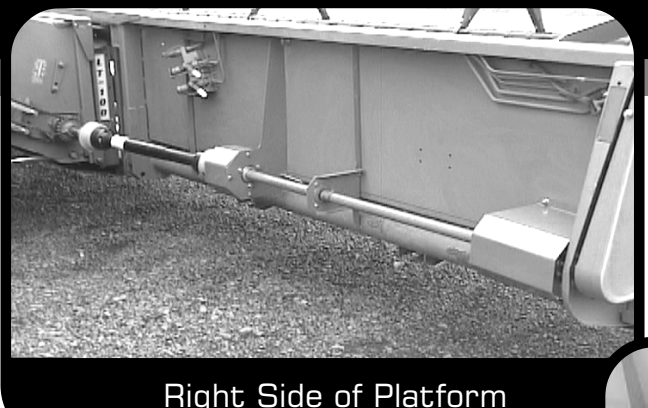
Right Side of Platform