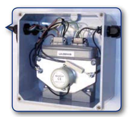
Clinometer and Controller