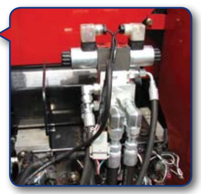
Variable Rate Control Valv