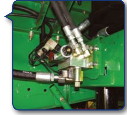
Variable Rate Control Valve

The clinometer based slope sensor continuously monitors the sloping field conditions and maintains a combine chassis position within 1/2 degree of level. The variable rate technology utilized in the leveling controller and hydraulic control valve allows for infinite leveling speed control from zero to maximum speed. The further the combine is out of level the faster the system corrects, and as the chassis approaches level, the leveling rate slows. This variable speed leveling is what allows Hillco