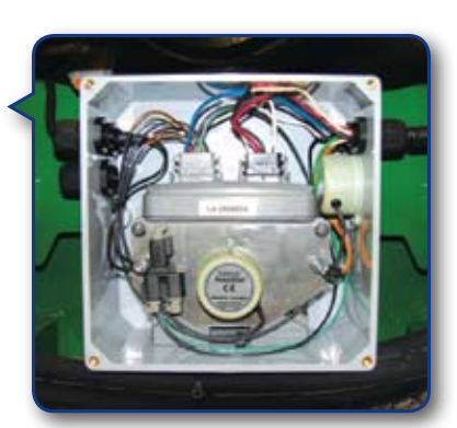
Clinometer and Controller